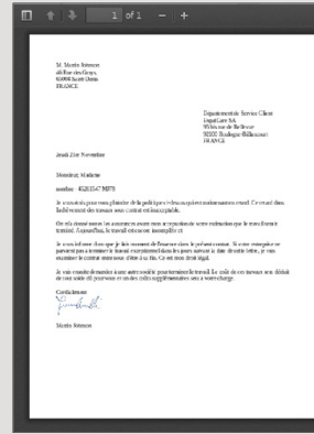
Managing customer queries sent by fax, letter or SMS